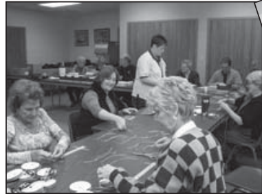
Invitation committee members and other volunteers all pitched in many months ahead to assemble the invitations.