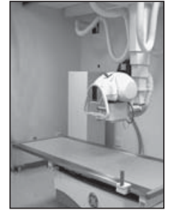
The Proteus XR/a

To funds for the renovation of CCH's Radiology Room #1 including the purchase of a height-adjustable, ergonomic X-Ray table