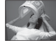
Lumiere Light Therapie

To purchase equipment for the Cuero Wellness & Rejuvenation Center